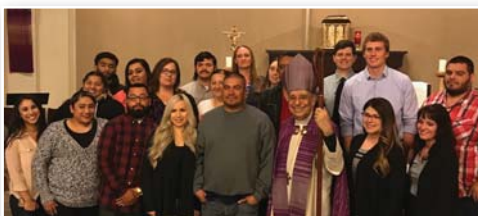
Adults Initiated into the Catholic Church 2018

If you are an adult and have questions about becoming Catholic and wish to be baptized — or, if you would like to complete your Sacraments of First Communion or Confirmation, the RCIA is the place to begin! RCIA will meet this Tuesday in the parish hall from 6:30–8:00PM. Please join us!