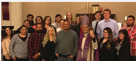
Adults Initiated into the Catholic Church 2018

If you are an adult and have questions about becoming Catholic and wish to be baptized — or, if you would like to complete your Sacraments of First Communion or Confirmation, the RCIA is the place to begin! RCIA will meet this Tuesday in the parish hall from 6:30–8:00PM. Please join us!